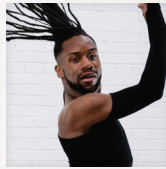
Lord Byron/ Ensemble Brian Bose