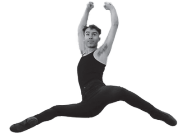
Ansgar ( Christian monk )