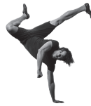
Eirick ( Viking boyfriend of Lagertha )