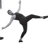
King Harald ( Lagertha's birth father )